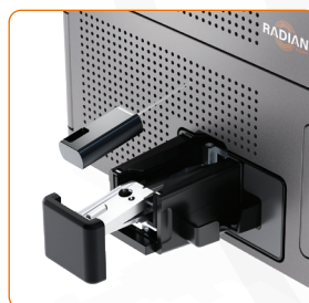
3. Insert capillary to start acquisition